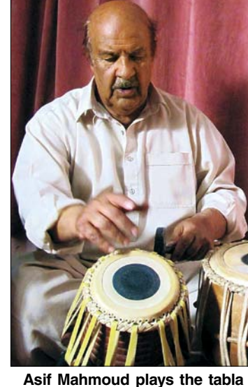
at his Kabul, Afghanistan home and studio.

(McClatchy-Tribune Information Services)